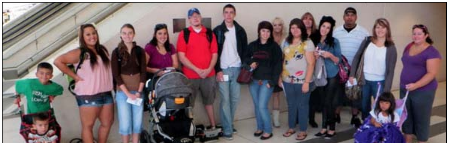
SCMC's 2010 SPEC Delegation (plus some family members at the airport to see off our travelers).