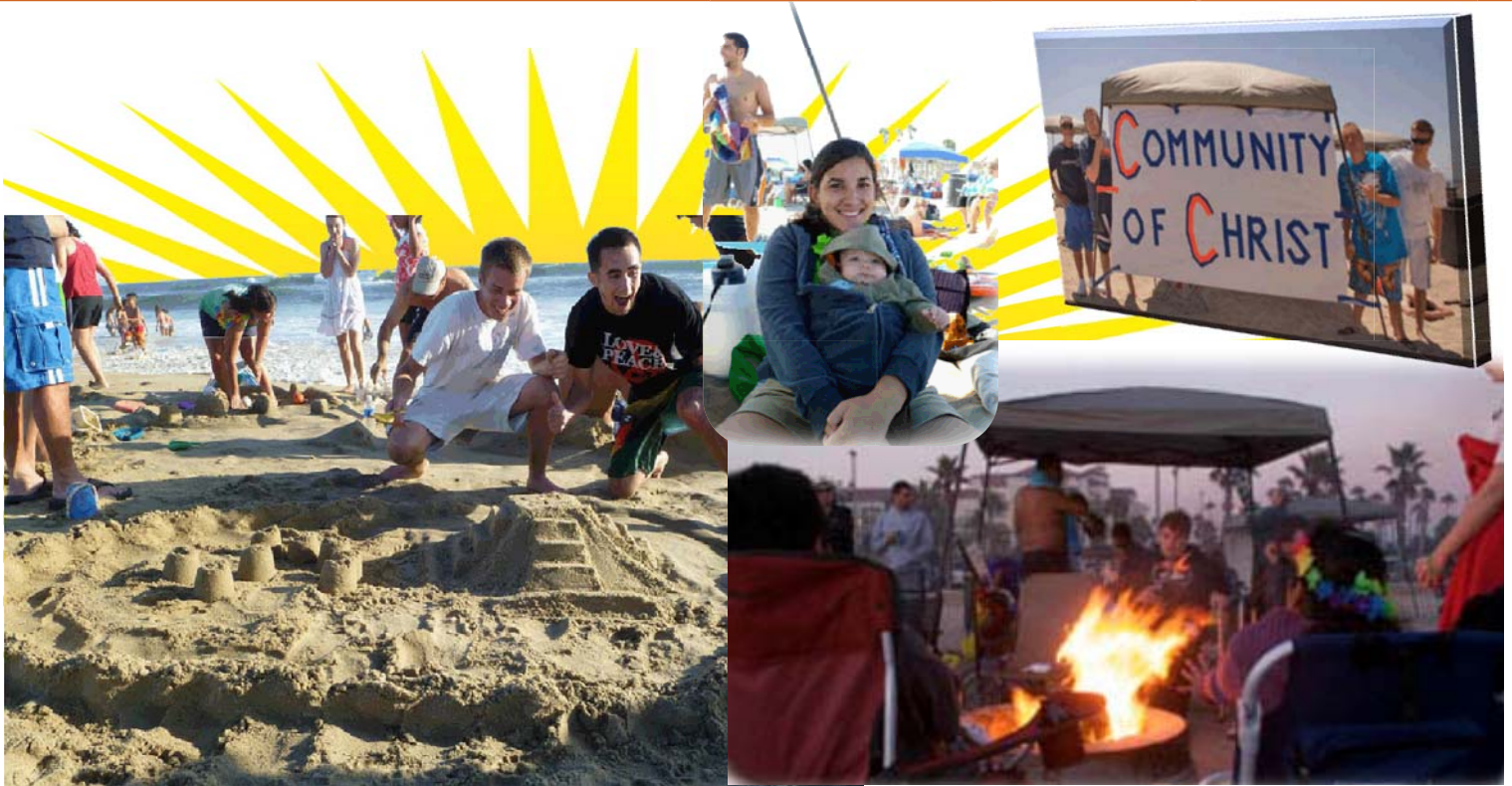
SCMC's 2nd Annual Beach Day featured volleyball, sand castles, campfire, and Moms and babies.