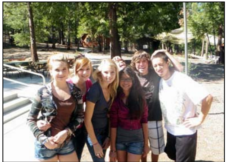
Just some of the more than 90 youth and children at this year's reunion.