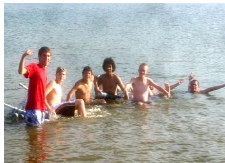
The boys "survive" by cooling off in Lake Perris

The first weekend in November was the Boys/Girls retreats. Both were a smashing success. The boys roughed it out at Lake Perris and learned how to survive the world by being men of God. They made shelters on the first night and spent part of Saturday building rafts then set sail on a race across the lake.