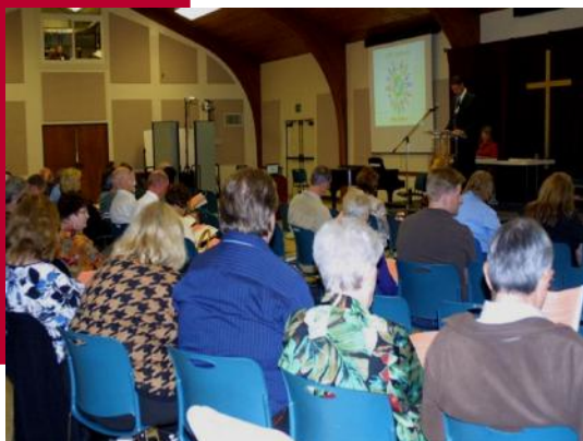
SCMC Conference in Session