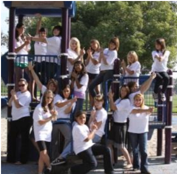
How about this group of "Angels"?

The girls were pampered by spending time enjoying a spa night, participating in "Top Chef" where they worked in teams to cook meals, and in a photo shoot to see the true beauty they hold within themselves. The theme, "Beautiful You", focused on one's inner beauty as seen through God's eyes.