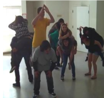
Journey Takers activity at Orange

know a Senior High youth or if you are one, we invite you to the next Journey Takers at Anaheim Congregation on Oct. 24-25.