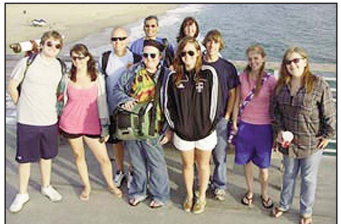
Part of the USA delegation on the beach in LA before departure.