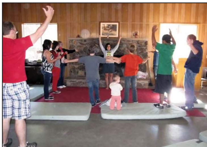
My God is so Big!