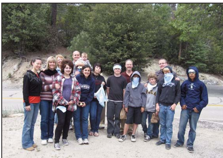
Campers sport their new bandanas that show their true colors.