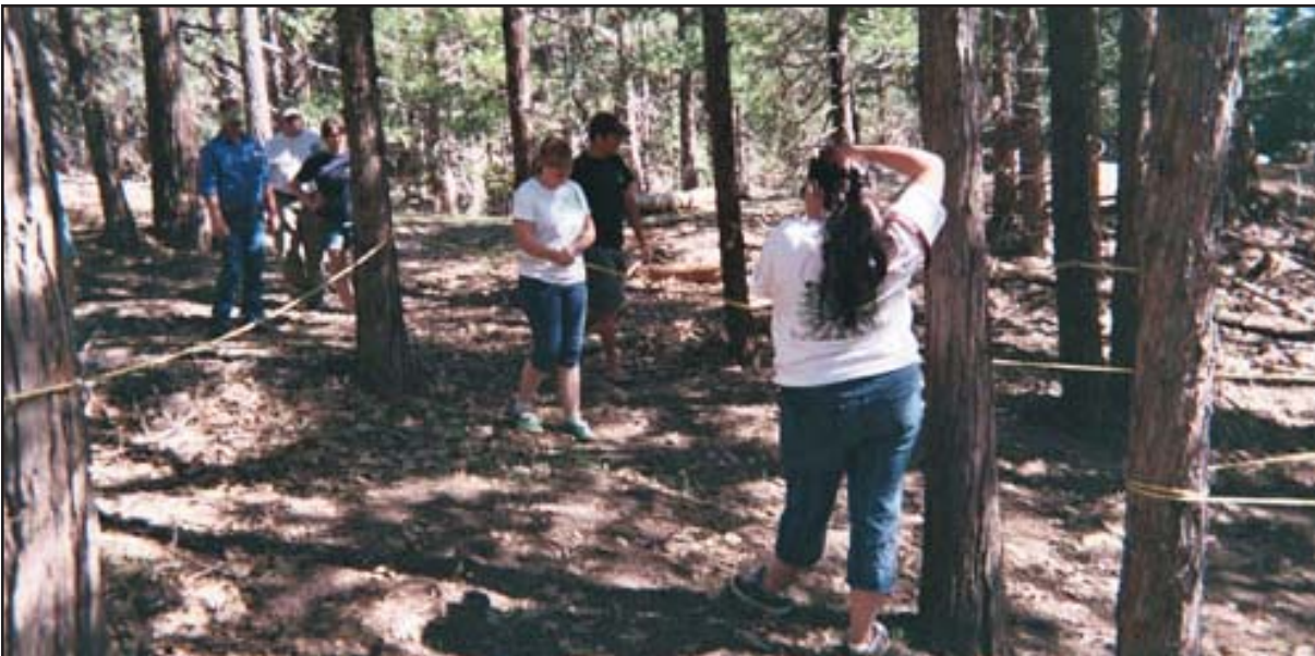
Participants navigate the maze hosted by the Boojum Institute.