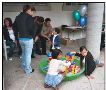
Kids enjoy playing in the sand (rice) at the Outreach International Booth.