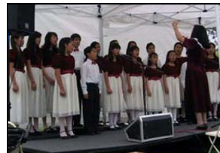
Glory Star Children's Choir performs at the festival.