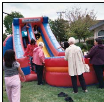
Anaheim Congregation sponsored the inflatable slide.

If you missed this inaugural event, please join us next year. If you were one of the hundreds who enjoyed the festival, please spread the word so that next year’s festival will be bigger and better.