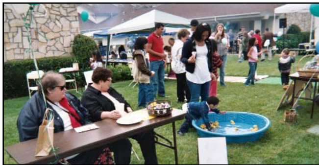
Kids enjoy the Duck Pond Booth.