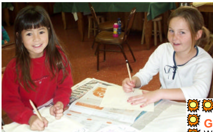
Two happy campers work on their batik designs