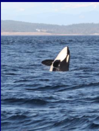
A whale “spies”

In his essay on wonder, David James Duncan describes wonder as being nearly indistinguishable from love. “...maybe love is just wonder aimed at a beloved. Wonder is like grace, in that it’s not a condition we grasp; wonder grasps us.” Even though Duncan implies that we cannot control wonder, he doesn’t mean either that we cannot prepare ourselves for