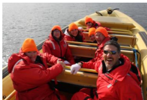
The joyful passengers

May you soon behold something or someone so indescribably beautiful as to overwhelm your heart and soul...and then may you tell of it...in word and in deed.