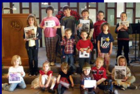
Christ's Kids share their special Christmas gifts