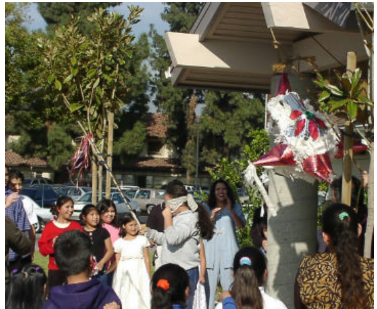
La Nueva Esperanza Posada — trying to break the piñata!

Christmas has been a very festive and worshipful time for all of us involved in Hispanic ministries, and we look forward to an exciting 2003 with God's blessings.