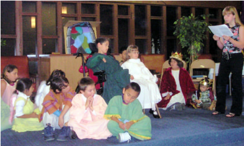
The children offer a Christmas play at Covina