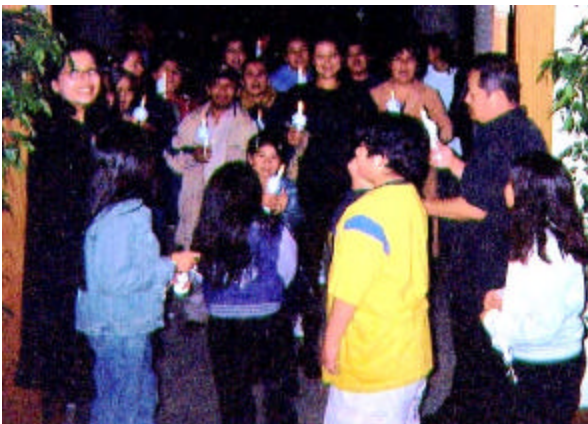
La Nueva Esperanza enjoys a Posada