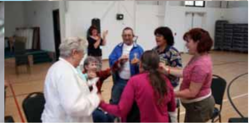
Adult Class activity