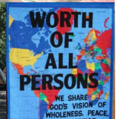
Another beautiful Mueller banner