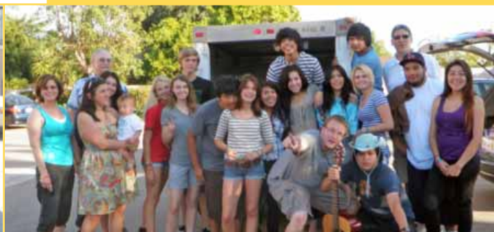
Journey Takers Caravan

1. She lives in the southern hemisphere where the seasons are reversed from those in the U.S. 2. A potato 3. The library—it has the most stories 4. You probably are playing Monopoly 5. One. It doesn't say that the people he met along the way were going to St. Ives 6. Water 7. Only once. After that, you will be subtracting 5 from 20, then 5 from 15, etc. 8. Only one (the last one) 9. There are no penguins in the Arctic; they are native to Antarctica