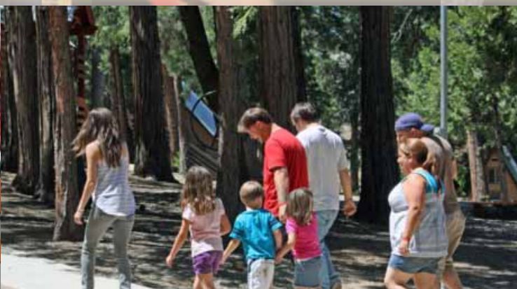
Time for a hike