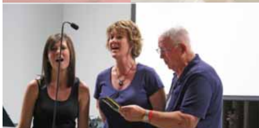
Three generations singing