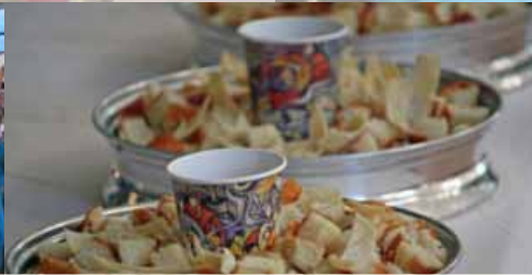
Closing Communion emblems