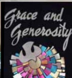
Another Mueller worship banner