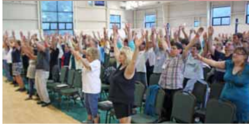
Praising in the Peace Center