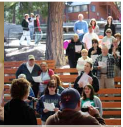
Morning worshippers sing