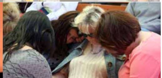
Praying for one another