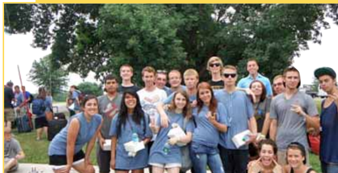
SCMC and SwIMC Youth at SPECTACULAR